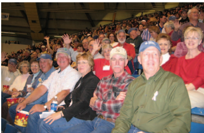
Our 1960's alumni watched as the Lumberjacks coasted to a 39-22 victory over Sacramento State at the Homecoming football game.

From the feedback received at the School, everyone enjoyed the weekend, including the faculty, staff, and students – new memories all around! Also, the roughly $4,000 that the alumni donated for construction of a Hogan on the Centennial Forest was greatly appreciated.