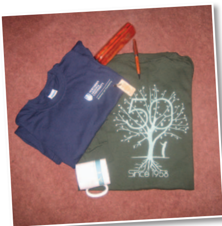
A sample of our 50th Anniversary memorabilia.

We also developed a short video of the school’s history that can be viewed on our website, and created a whole line of 50th Anniversary memorabilia items—pens, mugs, t-shirts, caps, key chains, and bookmarks—that can be purchased from our website. You can also contact April Sandoval by email ( April.Sandoval@nau.edu ) or by phone at (928) 523-6666.