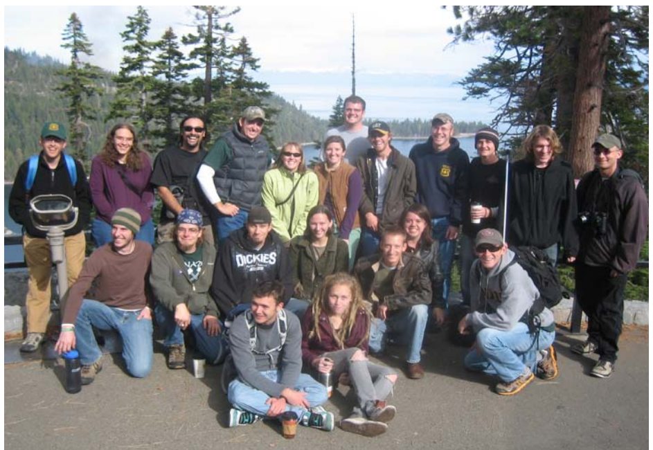
Some of the students and staff that attended the Society of American Foresters national convention, during their day-trip to Lake Tahoe.

The convention was a topic of discussion for weeks afterwards, and students are already excited about next year's convention in Orlando, Florida. We would like to thank all of those who supported us in our efforts to get to Reno.