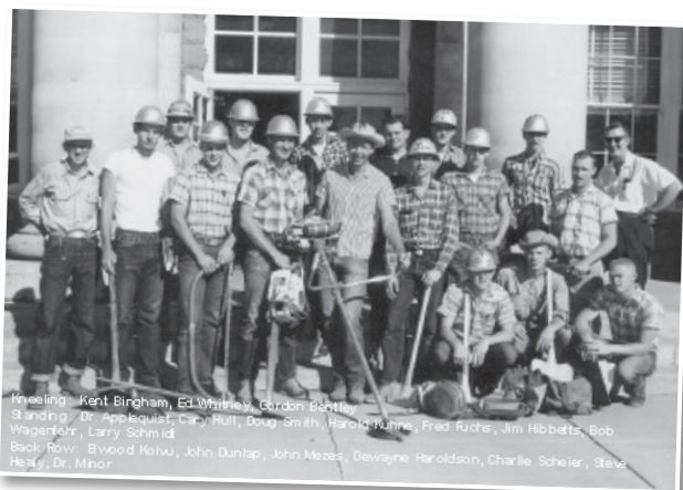
Students and faculty who participated in the 1960 summer camp. (Photo courtesy of Doug Smith, BSF 1962).